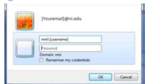
Figure 2: Windows 7 Password window